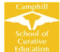
Camphill School of Curative Education