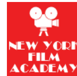
New York Film Academy