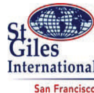
St. Giles International San Francisco