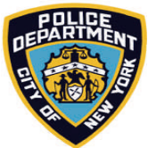
New York City Police Department

To our member organizations: We are reminding you to take note of Phase One of the Annual Review of evaluated learning experiences that was recently emailed to you. This review ensures the information submitted to colleges on your transcripts is consistent with the information National PONSI has published in our online Directory, College Credit Recommendations (CCR) Online . If changes in your organization's evaluated learning experiences have occurred, it is important to reflect this in your CCR Online listing. To keep us up-to-date and thus ensure the continued integrity of your credit recommendations to academic institutions, we ask for your cooperation in completing the survey by September 30 th . Thank you.