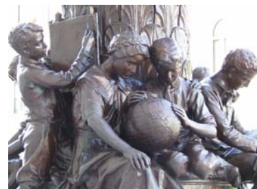
Sculpture Outside of the New York State Education Building in Albany, New York

"Change does not necessarily assure progress, but progress implacably requires change. Education is essential to change, for education creates both new wants and the ability to satisfy them." Henry Steele Commager