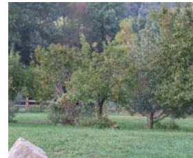
The Campus of Camphill Special School

The School of Curative Education at Camphill Special School, located in Glenmoore, Pennsylvania, offers an interdisciplinary approach to the education and support of children and adolescents with special needs. Like Waldorf education, curative education is based on Rudolf Steiner's spiritual-scientific view of the human being, anthroposophy. Worldwide, there are over 550 centers of anthroposophic curative education in more than 40 countries, as well as an international network of about 60 professional training courses.